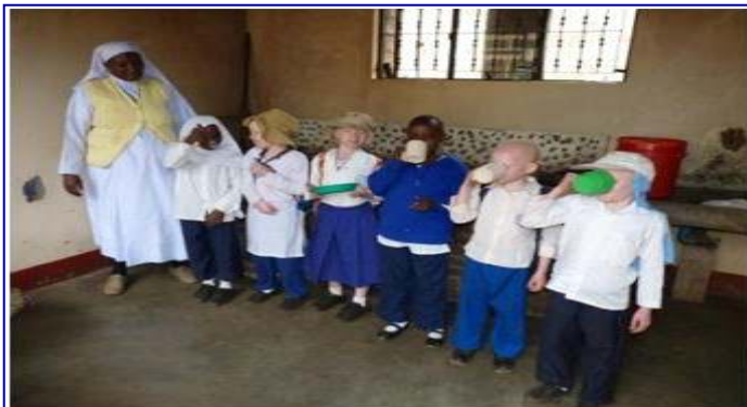
Albino Children in Moshi